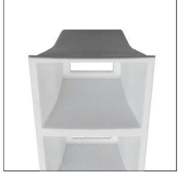
WM lens shade