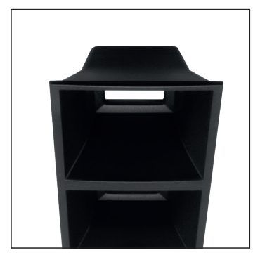
BM lens shade